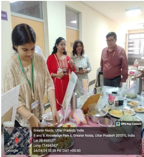
Greater Noida, Uttar Pradesh, India 8 and 9, Knowledge Park II, Greater Noida, Uttar Pradesh 201310, India Lat 28.459527° Long 77.494242° 24/04/24 12:38 PM GMT +05:30