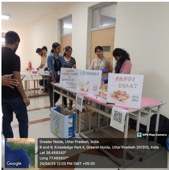
Greater Noida, Uttar Pradesh, India 8 and 9, Knowledge Park II, Greater Noida, Uttar Pradesh 201310, India Lat 28.459243° Long 77.493937° 24/04/24 12:03 PM GMT +05:30