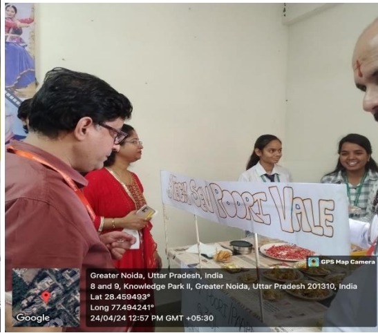
Greater Noida, Uttar Pradesh, India 8 and 9, Knowledge Park II, Greater Noida, Uttar Pradesh 201310, India Lat 28.459493° Long 77.494241° 24/04/24 12:57 PM GMT +05:30