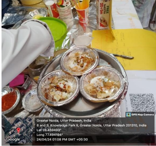
Greater Noida, Uttar Pradesh, India 8 and 9, Knowledge Park II, Greater Noida, Uttar Pradesh 201310, India Lat 28.459493° Long 77.494194° 24/04/24 01:08 PM GMT +05:30