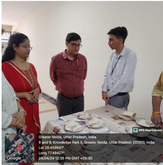
Greater Noida, Uttar Pradesh, India 8 and 9, Knowledge Park II, Greater Noida, Uttar Pradesh 201310, India Lat 28.459541° Long 77.49427° 24/04/24 12:35 PM GMT +05:30